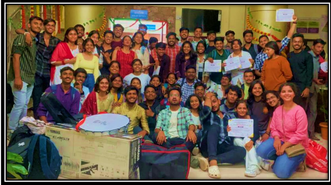
ADYPSOE team at the Youth festival