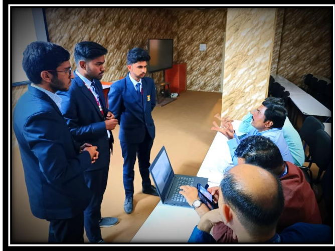
Discussion in progress during the event